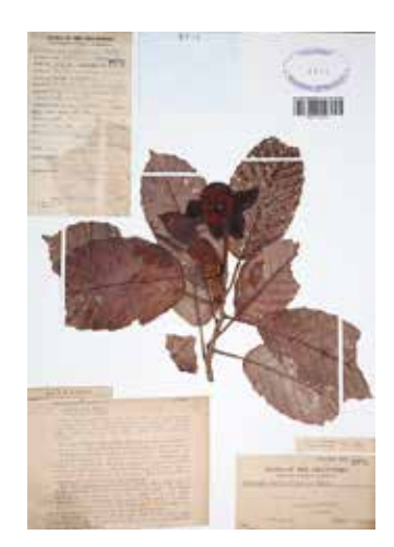
Collected by M.D. Sulit | April 22, 1947 | Mt. Makiling, Laguna, Luzon Island, Philippines | Philippine National Herbarium (PNH 6978)