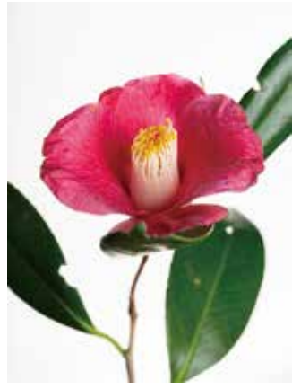
Camellia japonica L.